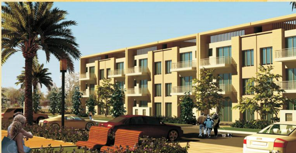
G+2 Executive Floor