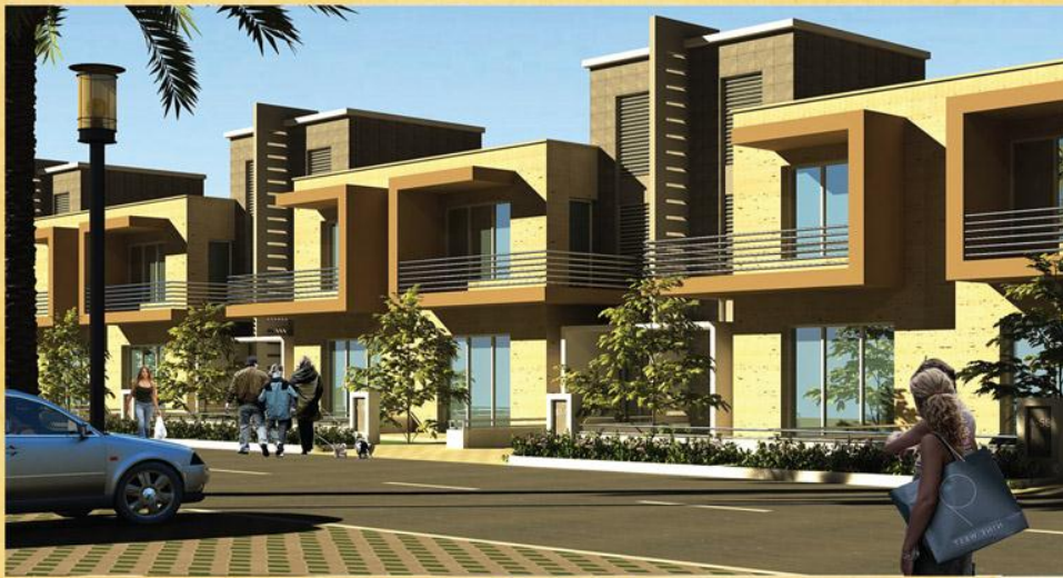
Limited Edition... Villas

Your time has arrived and how. Your chance to make the most of now. Krish Presents a lavish life amidst green. Get close to your real self with exquisitely designed villas and executive floors specially for you. Situated right in the heart of Bhiwadi, Krish Harmony encompasses all the sharp features with just the right colours, all the amenities and much, much more. The low dense, world class infrastructure is waiting for you with arms spread.