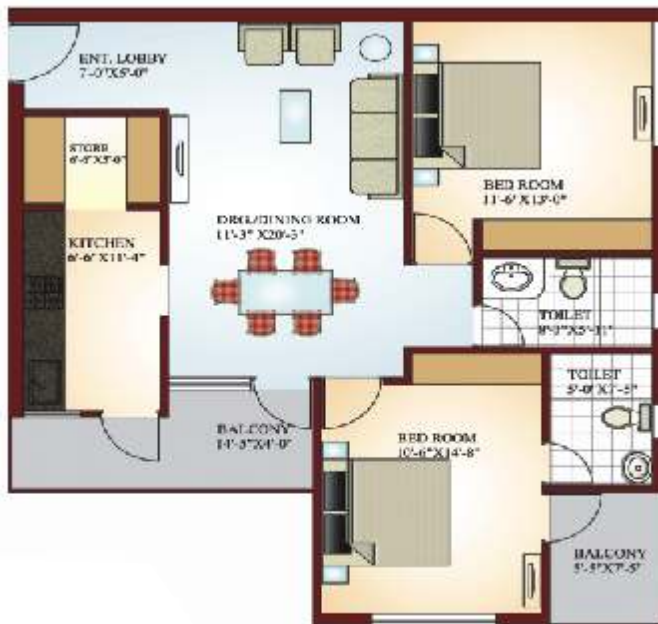
2 BEDROOM APARTMENT (SUPER AREA APPROX. 1210 SQ.FT)