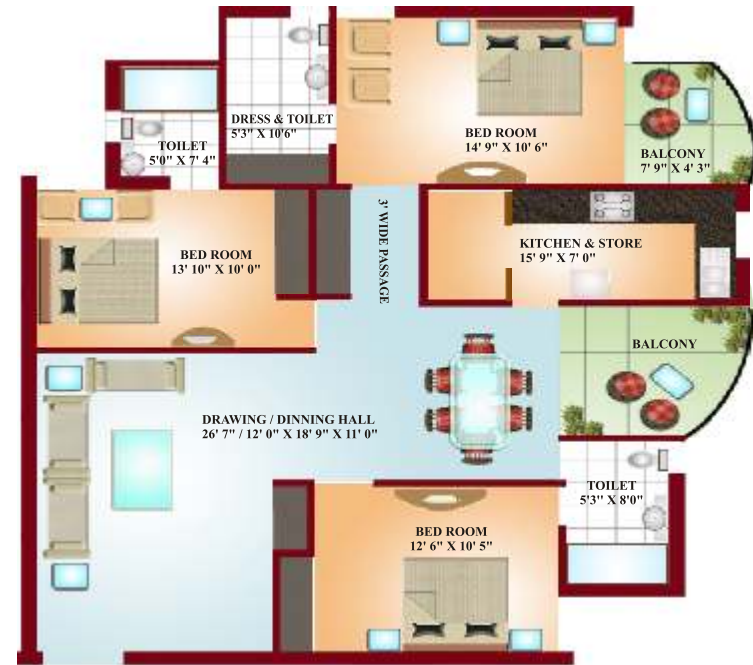
3 BEDROOM APARTMENT (SUPER AREA APPROX. 1665 SQ.FT)