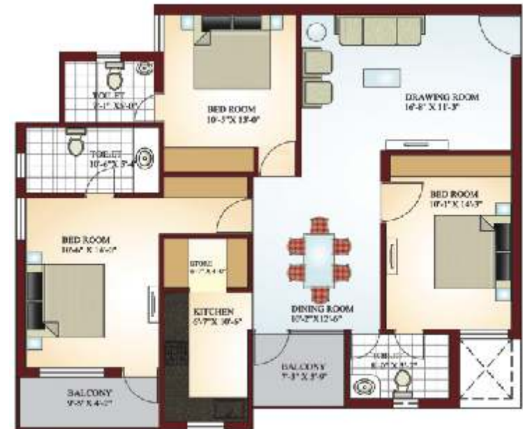
3 BEDROOM APARTMENT (SUPER AREA APPROX. 1520 SQ.FT)