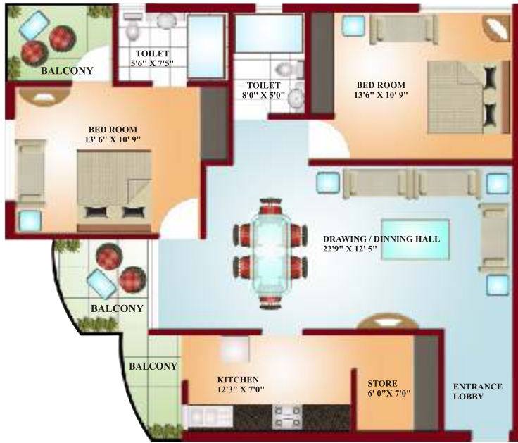
2 BEDROOM APARTMENT (SUPER AREA APPROX. 1345 SQ.FT)